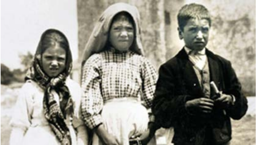
The three children: Jacinta, Lucia and Francisco

Francisco had personal experience of the things he told Lucia and Jacinta, especially during his long sickness which ended in his death.